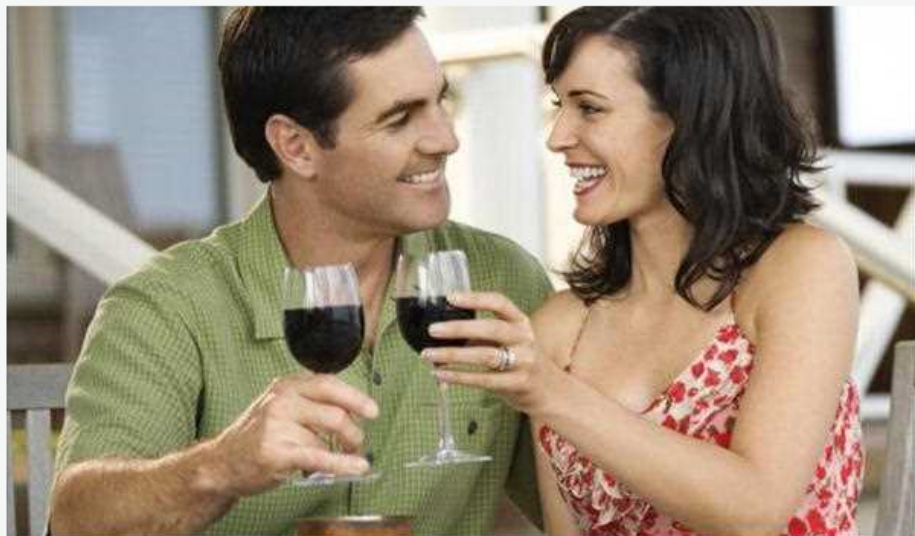
Pheromones Human Pheromones Pheromones Perfumes Female

The insect and also animal kingdom rely more on pheromones than humans. human pheromones mostly are used for destination, while insects rely on the excreted chemicals for survival. They could use them to warn the swarm of predators and can alert a man or woman of readiness to mate. Without these very important excretions, survival of most insects would soon disappear.