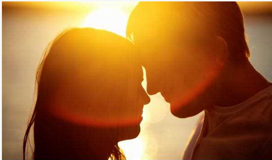
Pheromones Pheromone Cologne Best Pheromone Pheromone Product Pheromones

Pheromones are chemical signals very first found as a sexual intercourse attractant in insects but are also present in people. Pheromones are not almost intercourse as organizations would like you to believe that.