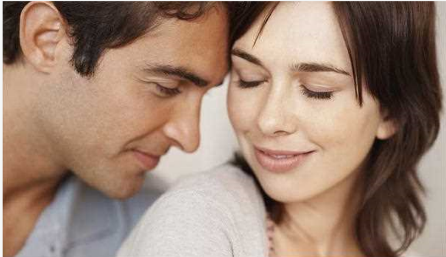
Pheromones Androstenone Human Pheromones Attract Women Sexually

To gain additional value, thus appearing more domineering or intimidating. Patented regarding improving debt collection by spraying the final demands - not only do more people pay up, they also pay quicker.