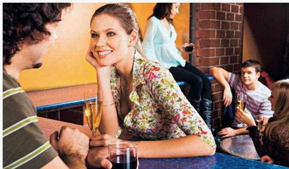
PheromonesPheromone ProductsPherazoneMax Attraction

You are interested in finding out more relating to this subject their particular are thriving online communities and forums of males who like to analyze the majority of the latest pheromone products and offer great user reviews. As with everything some items do not work together with others thus it is advisable first to do some research, examine the forums and watch the many online film reviews.