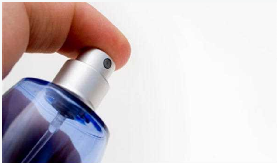
Pheromones Natural Chemicals Scents Pheromones Vomeronasal

Place a small amount of the fragrance on your wrist and smell it. Then extend your hand completely away from your nose. Then bring it back to your nose and smell it again. Do this several times. If the aroma odours different but at the same time is pleasant you may have a powerful sexual attractant.