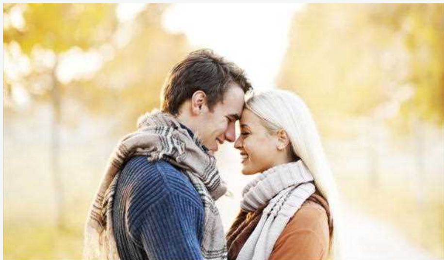
Human Pheromones Pheromones Aphrodisiac Pheromone Products Sex

Evidences of Human Pheromones Although many scientists disagree to the existence of human pheromones, a number of experiments have been done to prove that human pheromones do exist. One of those was the particular McClintock Effect which states that ladies perspiration can affect other women's period.